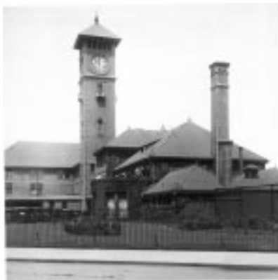
Union Station in the early 1920s

Did you know that Union Station is built where a 15-foot deep lake once stood? Or that the original planned site of the station was where the main Portland post office is now located? Join us at Union Station on November 15, for a Foundation members-only lecture and tour of this amazing vestige of the Victorian era in Portland. We can't guarantee that you will be able to catch a sturgeon in the arrival and departure area, as occurred during the flood of 1948, but you will definitely learn something new about this venerable Rose City institution. Designed by the Kansas City firm of Van Brunt and Howe, Union Station was a bustling place in its early decades, when almost 100 passenger trains a day chugged in and out of the Rose City. Travelers and residents alike looked to the clock tower, to